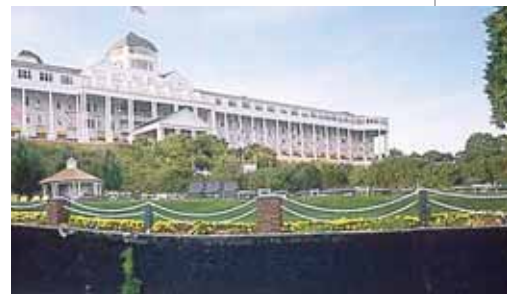
left to right: Thoroughbred Golf Club at Double JJ Resort; the Golf Club and Village at Bay Harbor; the historic Grand Hotel on Mackinac Island.